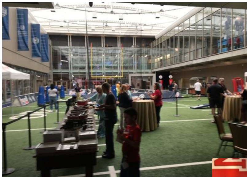
Attendees enjoyed dinner and drinks on the floor of the College Football Hall of Fame Indoor Playing Field.