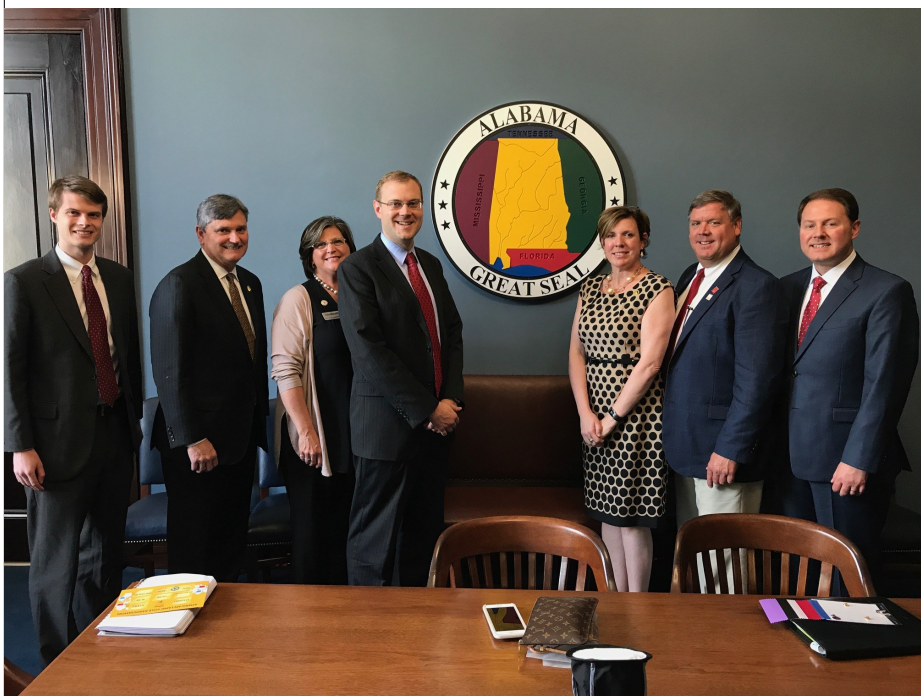
Alabama delegation meets with the staff of U. S. Senator Luther Strange.

SLTA Members met on the steps of the Capitol after a successful day!